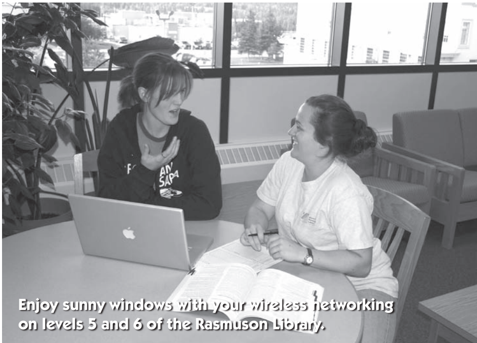
Enjoy sunny windows with your wireless networking on levels 5 and 6 of the Rasmuson Library.

The Rasmuson is networked for wireless access throughout the building. Windows with a view of the Alaska Range and Denali are found on Levels 5 and 6.