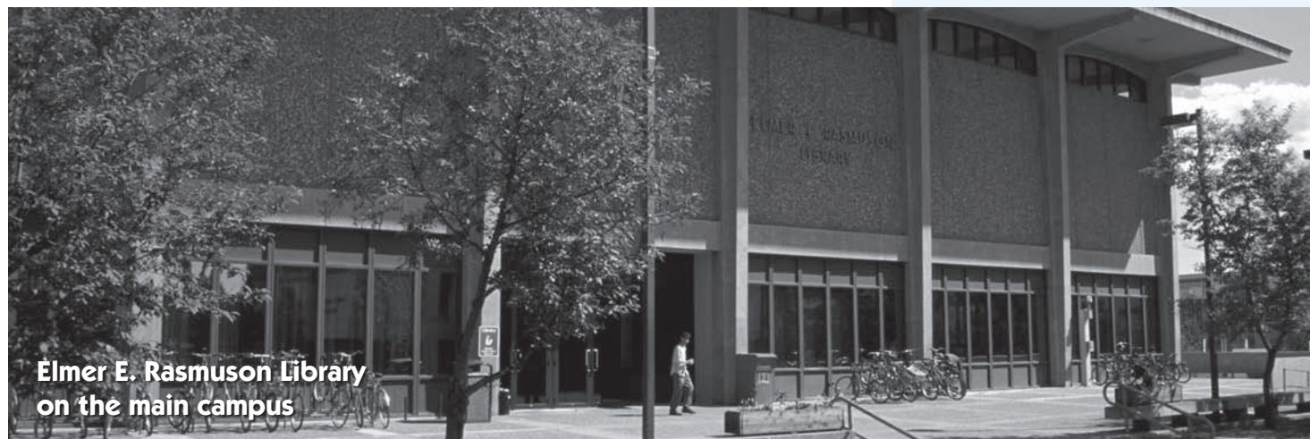
Elmer E. Rasmuson Library on the main campus

Alaska's Digital Archives presents a wealth of historical photographs, albums, oral histories, moving images, maps, documents, physical objects, and other materials from libraries, museums and archives throughout our state. You should also check the Alaska History Store and image galleries at http://photolab.elmer.uaf.edu .